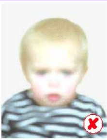
Blurred or too light