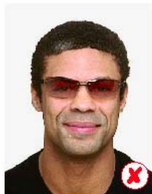
Dark tinted glasses